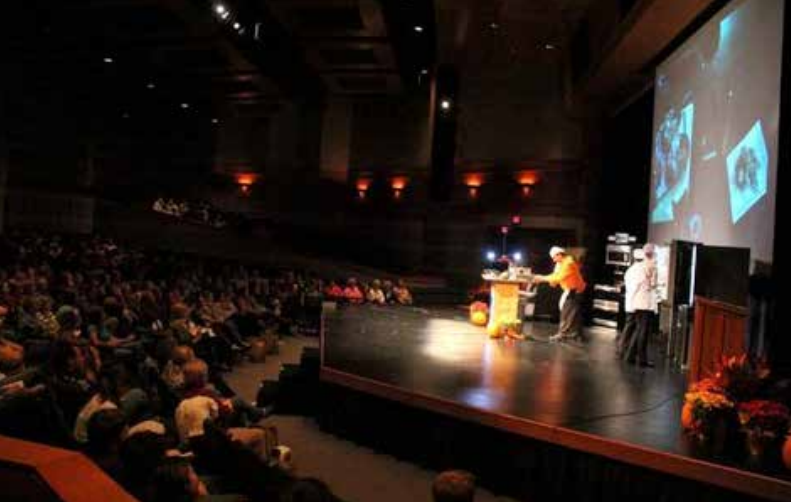
Fall & Holiday Cooking Show of Marshall, Minnesota. Sponsored by: Hy-Vee and Marshall Radio