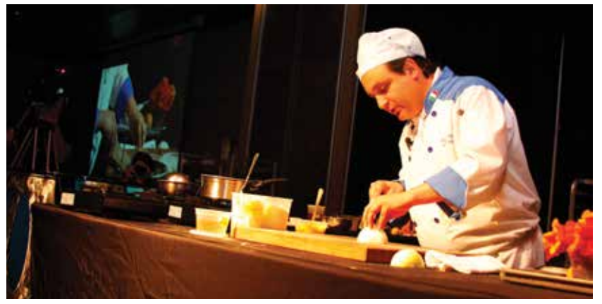
■ Institute for the Culinary Arts, Swanson Conference Center, Omaha, NE