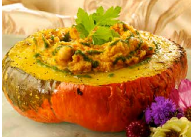
■ Pumpkin Hummus served in a roasted mini turban pumpkin