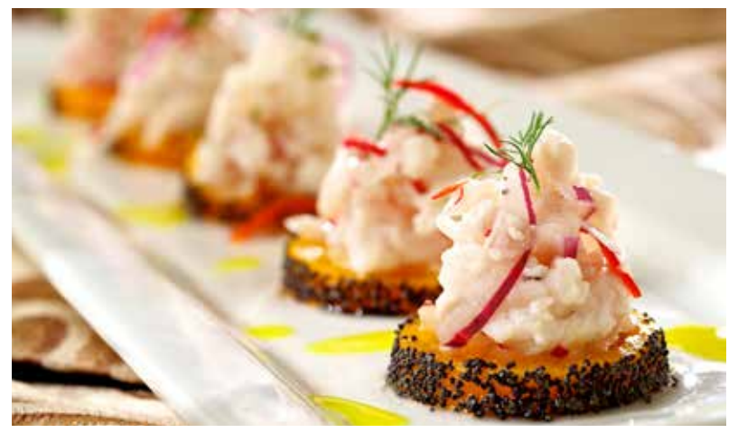
Sea Bass Ceviche, toasted poppy seed crusted pumpkin round, turmeric oil drizzle