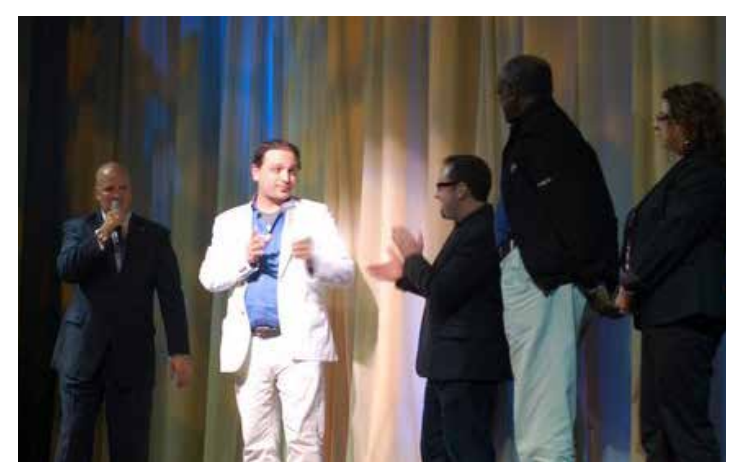
■ Inspirational Speaker Event for Celebrity Cruises