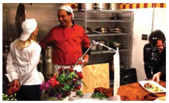
■ Jersey Gems — photo shoot