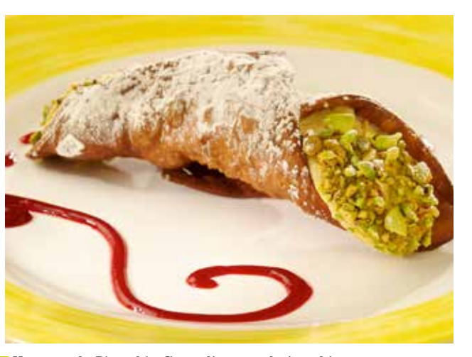
Homemade Pistachio Cannoli, toasted pistachio, dark cherry sauce