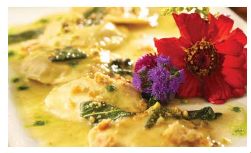
Homemade Pumpkin and Amaretti Ravioli, tossed in a Marsala sage emulsion