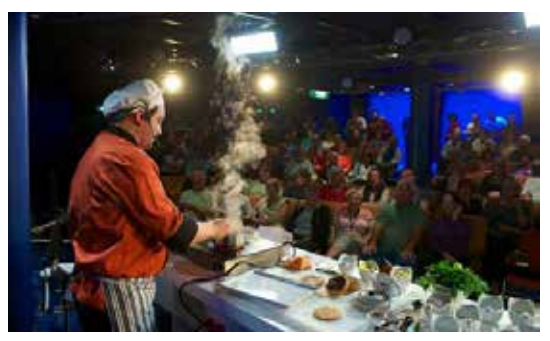
Culinary demonstration aboard Celebrity Cruiselines