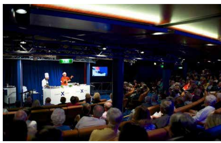
■ Transatlantic Cooking Show aboard Celebrity Cruises