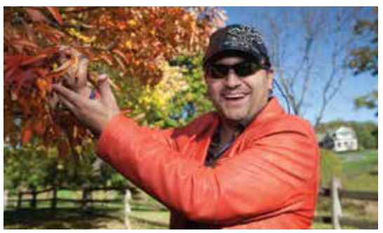
Autumn — HTTV — farm episode