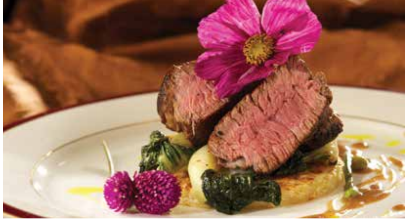
Pan-seared Bison Filet Mignon, orange & honey glazed bok choy, risotto griddle cake, sautéed bud chive garnish